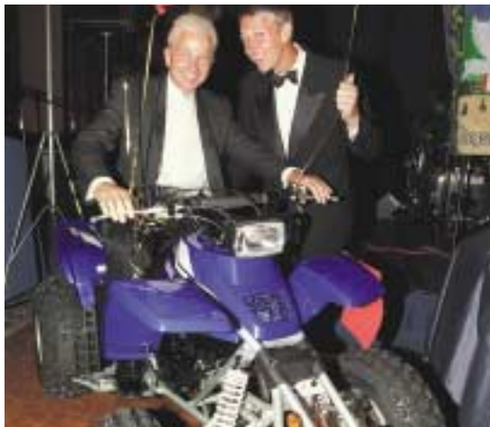
David Gower and Gary Lineker investigate the quad bike which was supplied for the Auction by Yamaha UK.