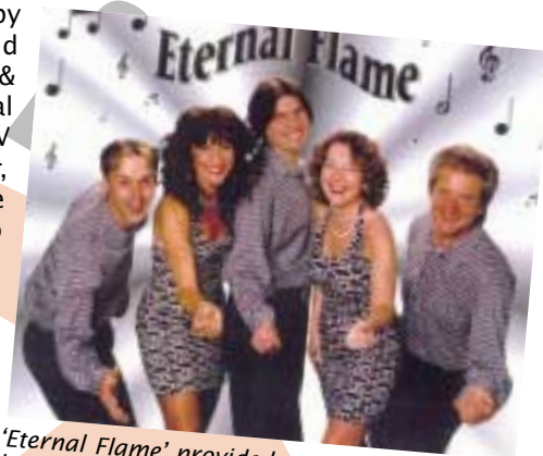
'Eternal Flame' provided music into the early hours of the morning.

So far the total sum raised from the Ball is in excess of £30,000 . A huge thank you to all businesses and individuals who supported this event.